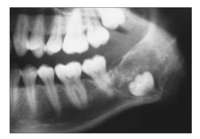
Figure 1: Panoramic radiograph showing a mixed radiolucent-radiopaque lesion in the left angle of the mandible.