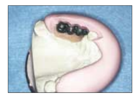
Figure 1c: After a try-in with prosthetic teeth, an index is made and then used to guide the technician's wax-up of a cast frame.