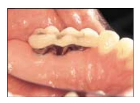
Figure 1d: A metal and ceramic fixed partial denture was selected because of restricted interarch space.

prosthetic experience or desire to avoid conventional removable prostheses.8 Patients were excluded if they had a brittle medical condition or a condition that precluded minor oral surgery, if their expectations of outcome were unrealistic, if they had a serious psychiatric disorder, if they had a history of substance abuse or if the quantity of the remaining bone was insufficient to accommodate an implant measuring 10 mm long and 3.75 mm in diameter.8 The problem of insufficient bone occurred infrequently, in patients with advanced resorption of the residual ridge and unfavourable proximity of pneumatized contents of the sinus or inferior alveolar canal. The implant dimensions mentioned were those of implants available at the beginning of the study. Subsequent availability of implants 7 mm long enabled their use as well. Treatment planning principles, which evolved on the basis of experience and published outcomes, led to the dual objectives of a