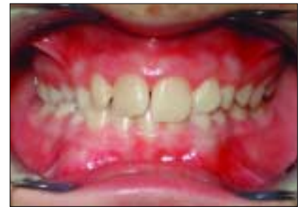
Figure 2b: Intraoral view illustrates mild shift in occlusion to the right at the 2-year follow-up visit.