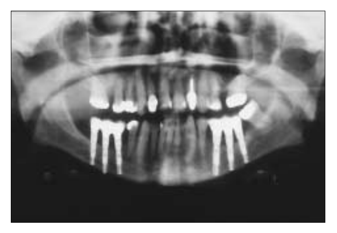
Figure 1 : Post-treatment Panorex image showing implant placement after nerve transposition. The inferior cortex of the mandible is engaged for optimum osseointegration.

radiation-intensive and costly imaging studies. Simple panoramic radiography and clinical examination are all that is required.