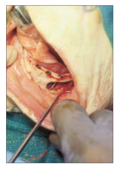
Figure 2: Intraoperative view of nerve retraction and implant placement with direct visualization of engagement of the inferior cortex.

Once this has been done, the implants can be placed under direct vision through the canal and into or through the inferior cortex ( Fig. 2 ). Finally, the excised bone can be replaced laterally around the implants as a bone graft. This is done simply to have bone surrounding the implant, on