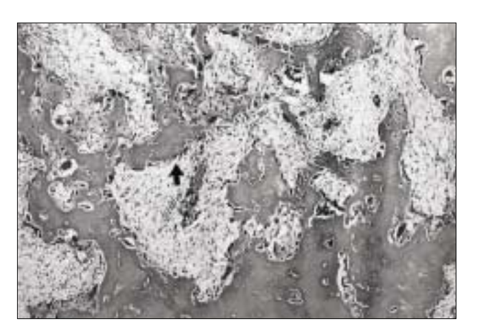
Figure 3b: Moderately cellular and vascular stroma with islands and trabeculae of cementum lined by cementoblasts (arrow) and scattered cementoclasts. (Hematoxylin and eosin stain of decalcified section; original magnification x 25.)

the faculty of dentistry of the University of Toronto, we found only 5 cases of benign cementoblastoma (including the case reported here) over the 10-year period from 1990 to 1999, inclusive. The total number of accessions in that period was 56,836.