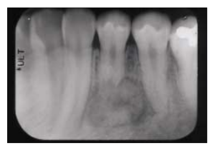
Figure 1: Periapical radiograph of cementoblastoma associated with the left mandibular first premolar.

Histologically, the lesion consisted of broad trabeculae of sparsely cellular cementum. These merged with areas of cemental islands in a vascular stroma with prominent cementoblasts and multinucleated cementoclasts (Figs. 3a and 3b). The peripheral zone of the tumour showed