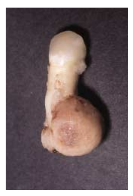
Figure 2a: Buccal view of gross specimen of cementoblastoma, which is fused to the partly resorbed root of the premolar.