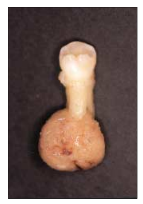
Figure 2b: Lingual view of cementoblastoma.

The benign cementoblastoma or true cementoma is a slow-growing, benign odontogenic tumour arising from cementoblasts. The lesion, which was first recognized by Norberg in 1930,<sup>3</sup> is rare with fewer than 100 cases ever reported.<sup>4-8</sup> In a survey of the Diagnostic Biopsy Service at