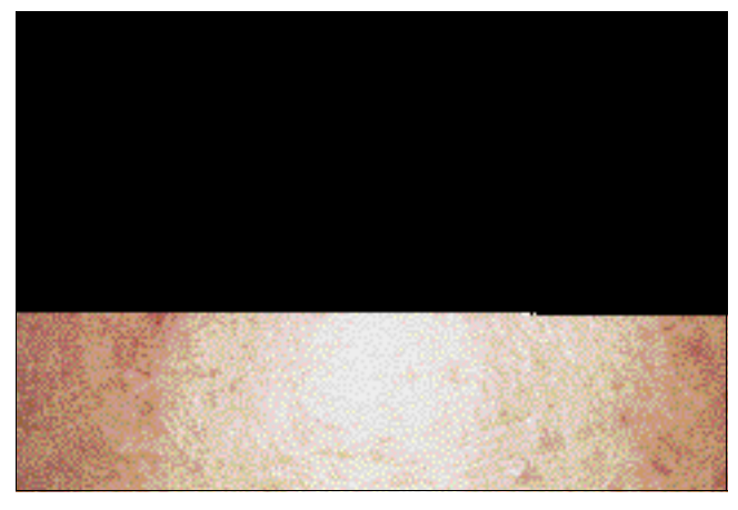
Figure 1: Psoriatic lesions on the patient's scalp. The patient's cutaneous lesions presented as silvery scales.

The lesion resolved on its own and had disappeared completely one month after the biopsy was taken.