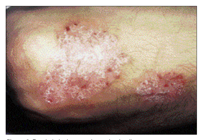
Figure 2: Psoriatic lesions on the patient's elbow.

In 1997, Younai and Phelan<sup>8</sup> reviewed the literature and presented a case of oral mucositis with features of psoriasis. Their review of the English-language and European literature