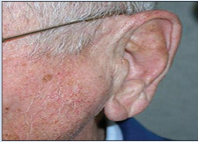
Figure 1: Clinical photograph of patient with preauricular swelling.