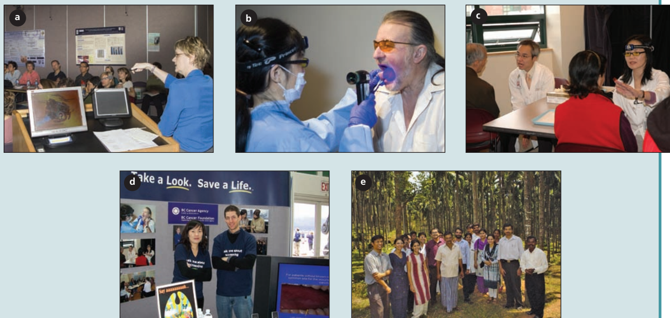
Figure 3: The outreach activities of the BC OCPP, which extend to the provincial, national and international levels, include: (a) Partnership with community dentists — continuing education for knowledge transfer and network building. (b) Outreach through community screening in a high-risk, medically underserved area in Vancouver’s Downtown Eastside. (c) Partnership with community representatives to provide oral cancer screening in local health fairs for the elderly Chinese in Chinatown, Vancouver. (d) Awareness building and continuing education at the Pacific Dental Conference, one of the largest dental conferences in North America. (e) Oral cancer screening camps conducted by the Manipal College of Dental Sciences, Mangalore, in rural villages of India.

information will improve the prediction of risk of progression. 15 It will also be used in patient management to design molecular probes that can be painted in the patient’s mouth to track the spread of genetically altered cells and to guide the selection of individualized drug interventions specific to molecular alterations within the tumour.