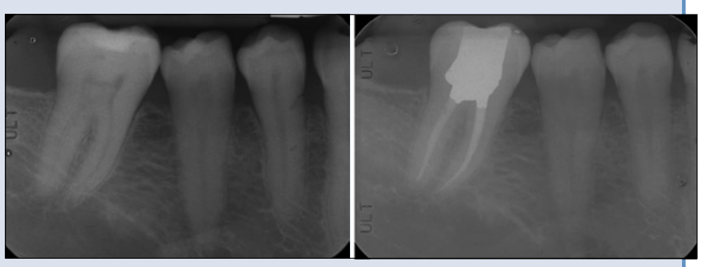
Figure 1: Periapical radiographs before (left) and after (right) endodontic therapy of tooth 46.