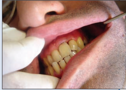
Figure 8: Labial view after restoration with light-cured composite.

cleaned and shaped using a diamond bur, then restored with conventional glass ionomer ( Fig. 6 ).