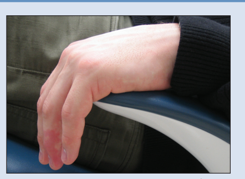
Figure 2: A relaxed hand is an indicator of muscular relaxation and calmness.

your body to sink into the chair — completely relaxed, soft, floppy, like a baby or a puppy ( Fig. 2 )."