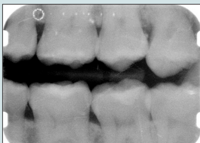
Figure 2: An image made on a photo-stimulatable phosphor (PSP) plate displaying widespread and severe damage to the PSP. This PSP should have been discarded long before it reached this state.

and environmental hazard, and digitization eliminates the need for removing and recycling silver.