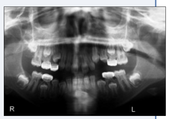
Figure 2: Orthopantomograph shows the remaining deciduous molars with stainless steel crowns and the lower canine in the midline associated with a cystic swelling.

At the age of 11 years, the boy presented with an asymptomatic unerupted tooth 33 and a firmly retained tooth 83. On clinical examination, a hard, painless swelling and slight expansion of the labial cortical bone could be palpated in the region of tooth 41. All lower teeth were responsive to ethyl chloride and sound, and there were no changes in axial position. Radiographs confirmed that the lower left canine