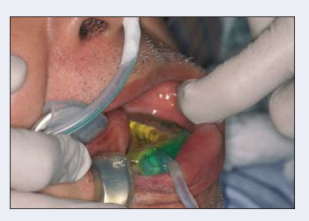
Figure 5: Mouthguard in patient's mouth.