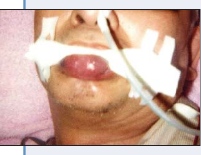
Figure 1: Patient with gauze wrapped around spatula between teeth.

A thorough examination of the patient was difficult due to the restricted opening of his jaws, but he appeared to have a significant overjet and overbite, suggesting a Class II, Division 1 occlusion. In addition, there was a severe selfinflicted traumatic lesion on his lower lip mainly on the left side (Fig. 2) and a transient ruminatory chewing cycle was observed. This suggested that the lower lip was trapped between the maxillary and mandibular anterior teeth and was