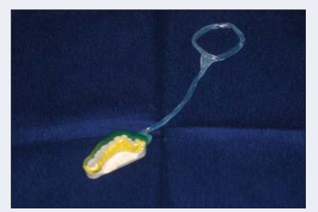
Figure 4: Mouthguard with handle.