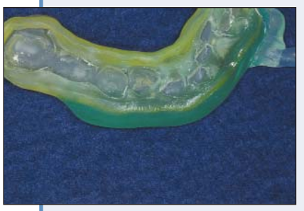
Figure 3: Polyolefin mouthguard.