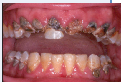
Figure 2: Typical pattern of methamphetamine-induced caries.

in several areas of the brain, including the nucleus accumbens, the prefrontal cortex and the striatum (a brain area involved in movement), which leads to neurodegeneration and neurotoxicity. 10-12 These actions result in high concentrations of these neurotransmitters in the synapses. The high concentrations of dopamine cause feelings of pleasure and euphoria, excess norepinephrine may be responsible for the alertness and anti-fatigue effects, and serotonin may cause cognitive impairment and eventual depression. 10,13,14