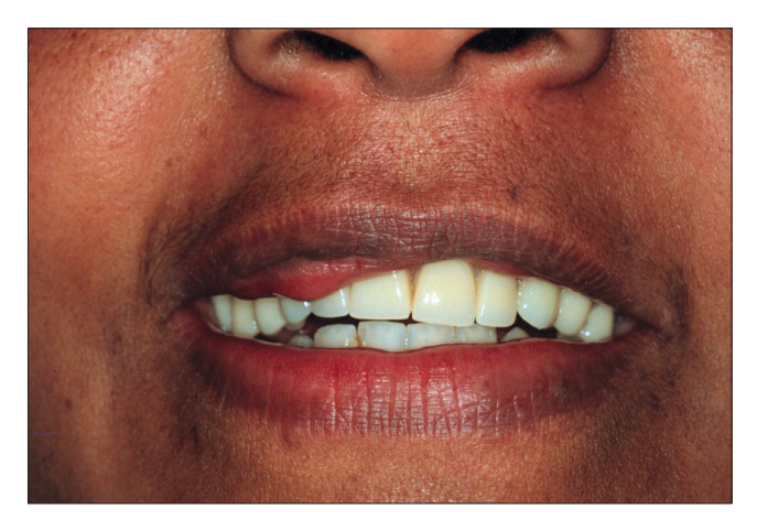
Figure 1: Initial aspect of the unilateral upper double lip.