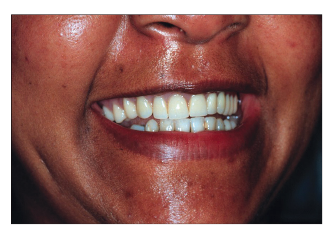
Figure 2: A 6-month follow-up photograph showing good esthetic result.

The acquired form of double lip may be secondary to trauma and oral habit, and may develop in association with Ascher's syndrome,<sup>2,7</sup> which consists of the triad blepharochalasis, nontoxic thyroid enlargement and double lip. The first case of double lip and blepharochalasis was reported in 1909,<sup>2</sup> and the association of these findings with thyroid enlargement