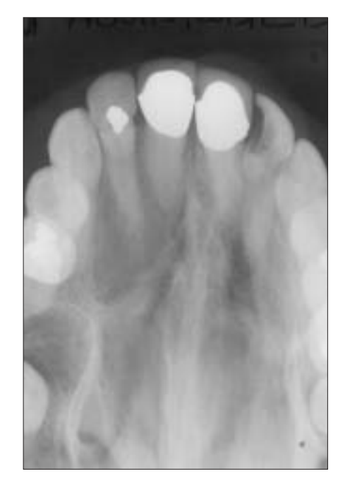
Figure 3: Occlusal radiograph shows a well-defined radiolucent area in the periapical region of the right maxillary incisors. There is slight root resorption of the central incisor.

abscess) that have perforated the bone. Vitality testing of the adjacent teeth can help to rule out this possibility. Very rarely, aggressive developmental odontogenic lesions, such as keratocyst, extend through the bone cortex to cause soft-tissue swelling. The long-standing nature of this lesion and the limited bone involvement (suggested radiographically) made this diagnosis improbable. Developmental gingival cyst of the adult has a predilection for the bicuspid or canine region and might have been considered in this case. However, this lesion is usually localized in the gingival or contiguous alveolar mucosa and would not cause the distension of the vestibular mucosa that characterizes nasolabial cyst. Another possible cyst of non-odontogenic origin is the epidermoid or epidermal inclusion cyst. A distinguishing feature of this very rare cyst