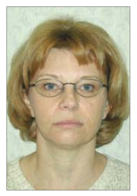
Figure 1a: Preoperative portrait photograph of a patient with a nasolabial cyst under the right alar base of the nose and the maxillary lip. Asymmetry cannot be easily discerned.