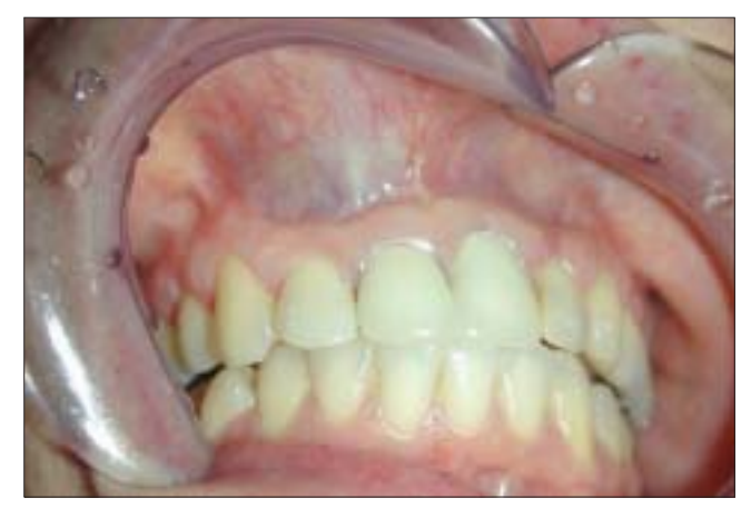
Figure 2: Intraoral view of the nasolabial cyst. The vestibule is distended by the submucosal cystic mass, which has a blue hue.

goblet cells (Fig. 6). The supporting fibrous wall was unremarkable.