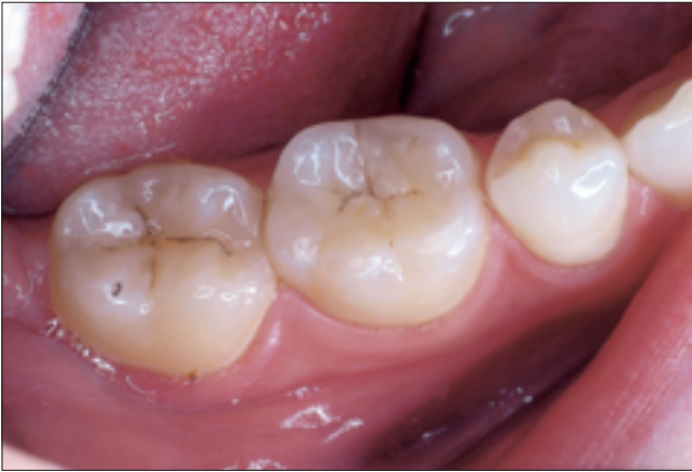
Figure 7: Tooth 36 after treatment.