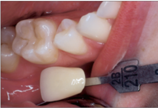
Figure 2: Shade tab and tooth 46.