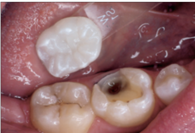
Figure 6: Mosaic shade tab for hypocalcification.

whom the same technique was used to esthetically restore 4 mandibular molars.