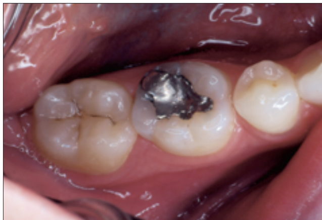
Figure 1: Tooth 36 before treatment.

A 26-year-old woman presented with breakdown around an amalgam filling on tooth 36 ( Fig. 1 ). The treatment plan called for an onlay to replace one cusp. The material selected for