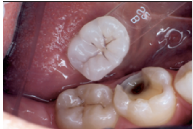
Figure 5: Mosaic shade tab for fissure stain.