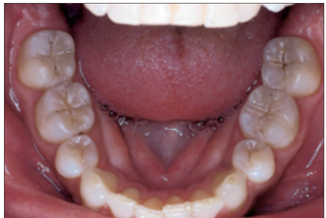
Figure 10: Lower arch after treatment in another patient.