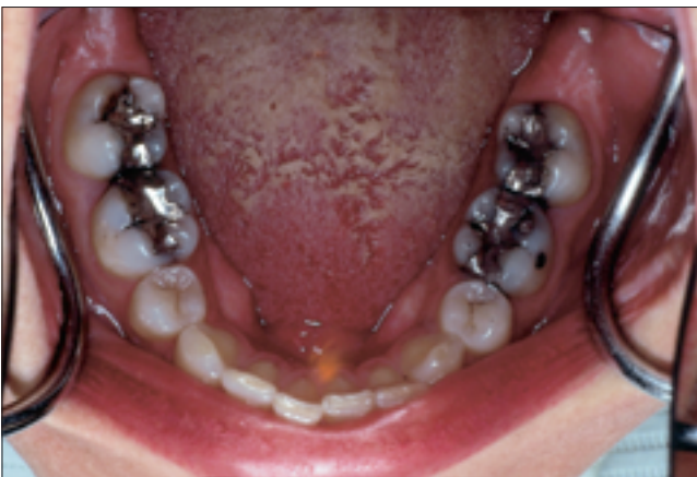
Figure 9: Lower arch before treatment in another patient.