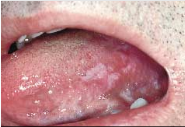
Figure 1: Squamous-cell carcinoma