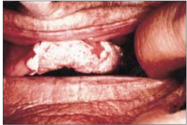
Figure 2: Verrucous carcinoma