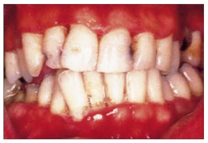
Figure 3: Acute necrotizing ulcerative gingivitis