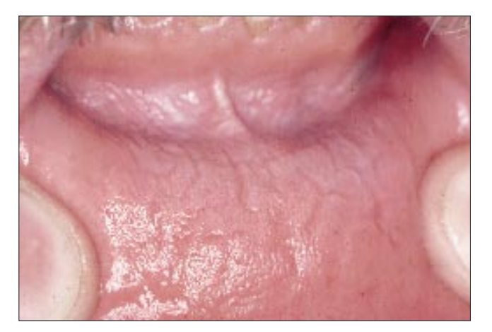
Figure 5: Smokeless-tobacco induced lesion

accompanied by halitosis (Fig. 3). ANUG primarily affects young adults who smoke heavily and have poor oral hygiene.<sup>3</sup> Although the exact interaction between ANUG and smoking is not clear, local and systemic effects have been suggested.<sup>7</sup> The progression of ANUG may be enhanced by plaque accumulation in sites with tar deposits and tissue ischemia secondary to nicotinic vasoconstriction.<sup>8</sup> Without treatment, ANUG may occasionally progress to