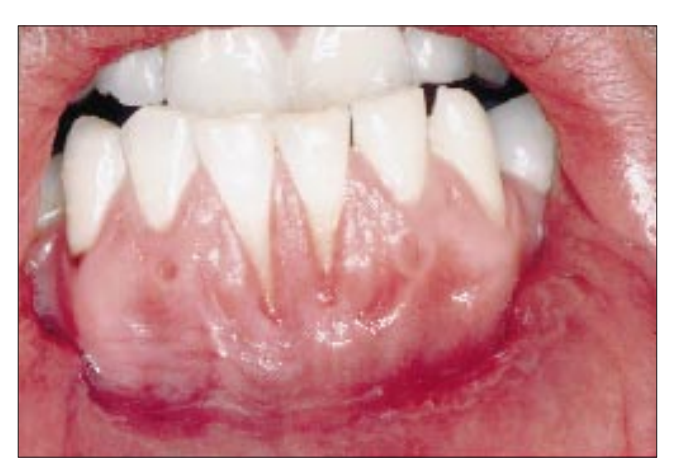
Figure 2: Extensive abrasions

accompanied by halitosis (Fig. 3). ANUG primarily affects young adults who smoke heavily and have poor oral hygiene.<sup>3</sup> Although the exact interaction between ANUG and smoking is not clear, local and systemic effects have been suggested.<sup>7</sup> The progression of ANUG may be enhanced by plaque accumulation in sites with tar deposits and tissue ischemia secondary to nicotinic vasoconstriction.<sup>8</sup> Without treatment, ANUG may occasionally progress to