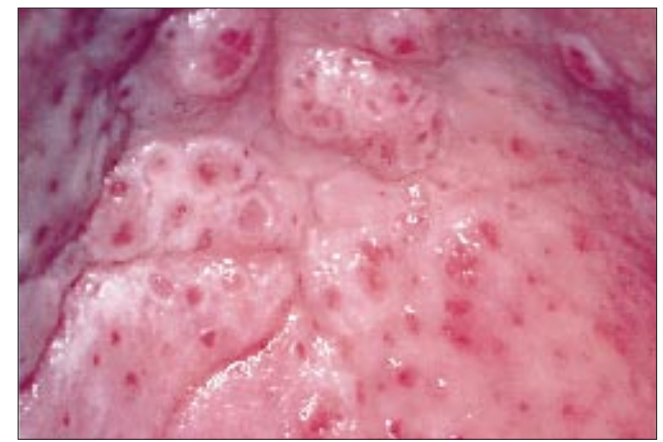
Figure 6: Nicotinic stomatitis