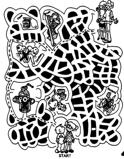
Find Your Way To The Dentist Office