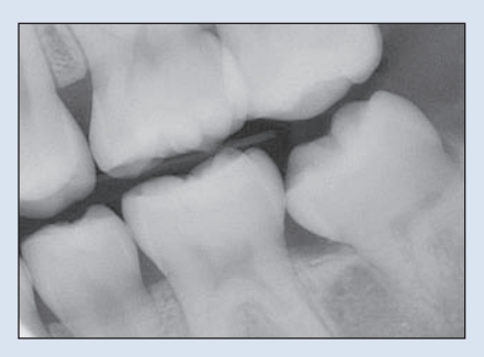
Figure 8: Slightly elongated left upper second molar (tooth 27) preventing upright growth of the new transplant.