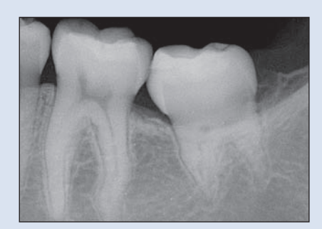
Figure 9: After 2.5 years, the mesial marginal ridge of the new tooth 37 was made level with tooth 36 using composite resin.