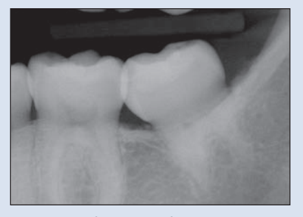
Figure 10: After 3 years follow-up, alveolar bone and lamina dura have developed completely for both the new tooth 37 and the distal aspect of tooth 36.