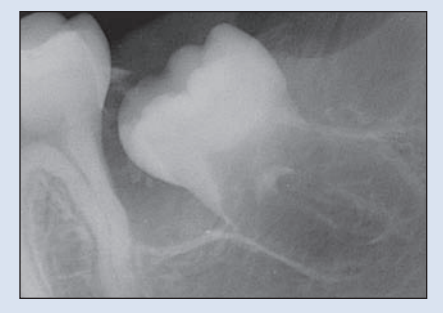
Figure 5: Radiograph taken immediately after placement of tooth 38 into the tooth 37 socket.