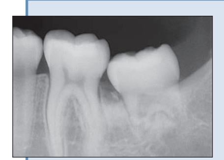
Figure 7: At 7 months after transplantation, developing lamina dura and alveolar bone surround the new tooth 37 and the distal root of tooth 36.