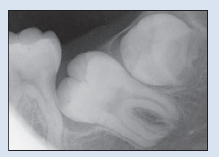
Figure 1: Radiograph showing the impacted left mandibular second molar (tooth 37) and the unerupted third molar (tooth 38). Note the early Hertwig's epithelial root sheath of tooth 38 beginning to form a furcation.