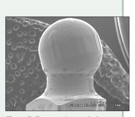
Figure 7: Electron micrograph shows that this ball attachment has become worn after 8 years in function. Note the position and direction of the worn surfaces, about 20° to the long axis of the attachment. (Original magnification ×30.)

lations. The device can be positioned on top of the residual ridge, behind the implants, or it can be aligned with the bipupilar plane. This manoeuvre is easy to perform when estimating angulations projected on the frontal plane but is more difficult for angulations on the sagittal plane because the cheeks and lips interfere ( Fig. 2 ).