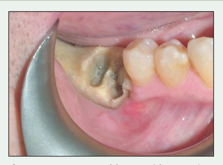
Figure 1: A 69-year-old man with necrotic bone and no healing 3 months after extraction of a tooth. The patient had prostate cancer and was receiving zoledronic acid.