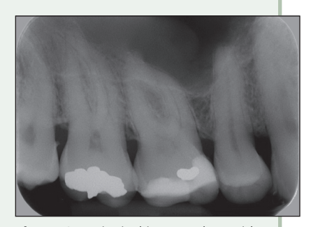
Figure 2: Periapical image taken with a storage phosphor sensor.