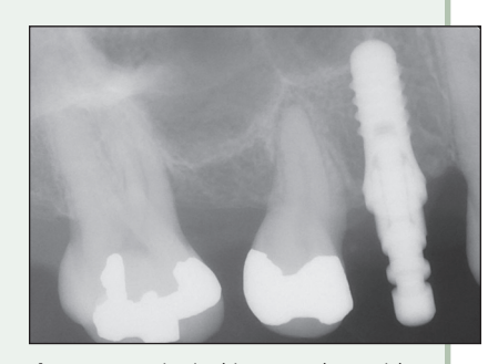
Figure 4: Periapical image taken with a direct sensor.

A patient brochure on bisphosphonates produced by McGill University's faculty of dentistry is available online at www.cda-adc.ca/jcda/vol-74/ issue-7/617.html.