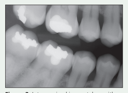
Figure 3: Interproximal image taken with a direct sensor.