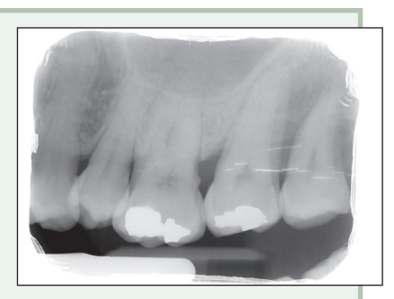
Figure 7: Storage phosphor sensor plate that is scratched and damaged at the edges.

with a range of exposures. A disadvantage of conventional film is that it is easily overexposed or underexposed. Although the latitude of direct sensors is comparable to that of film, storage phosphor sensors have a greater latitude and, under normal conditions, images are unlikely to be overexposed or underexposed.<sup>10</sup> The downside is the greater dose of radiation that patients will receive if greater exposure is used consistently.<sup>12</sup>