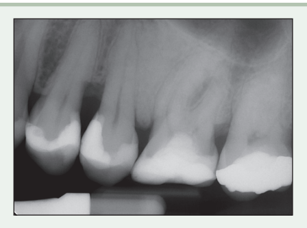
Figure 5: This image, taken with a direct sensor, doesn't show tooth apices.