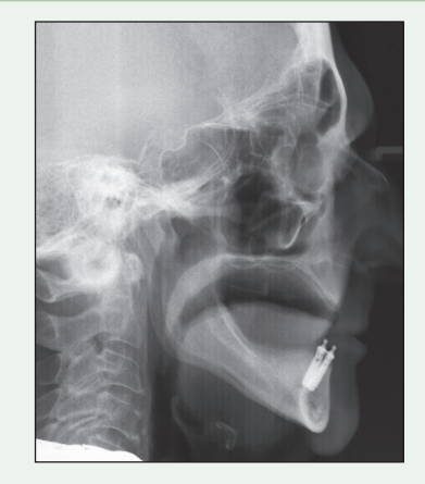
Figure 6: Teleradiography of the same patient as depicted in Fig. 5 shows moderate discrepancy of the implant positions projected on the sagittal plane.