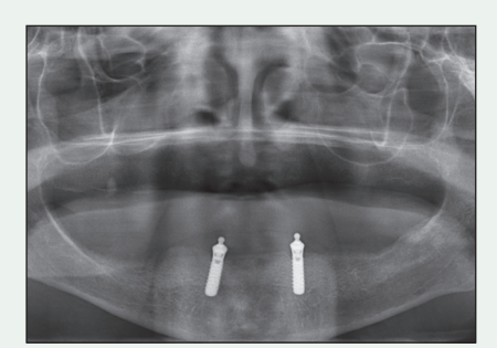
Figure 5: Moderate inclination of the right-side implant is evident in a frontal panoramic view.