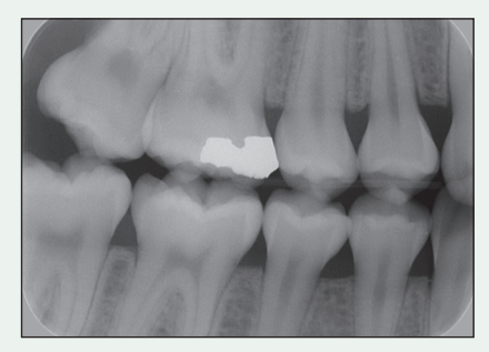
Figure 1: Interproximal image taken with a storage phosphor sensor.

Several experts believe that today's sensors are reaching their technological limits. Both direct