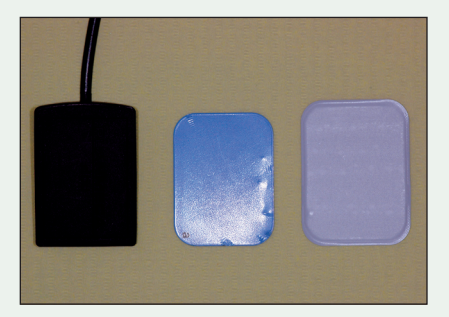
Figure 6: From left: size 2 direct sensor, size 2 plate for a storage phosphor sensor and size 2 film.