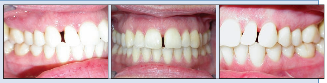
Figure 1: Initial intraoral photographs showing generalized spacing and absence of papillae in the upper anterior segment.