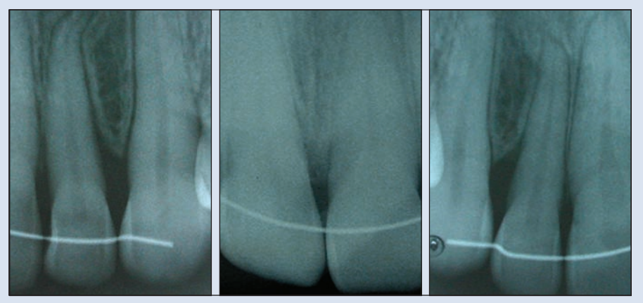
Figure 4: Post-treatment radiographs showing a significant reduction of the bony defects after space closure.