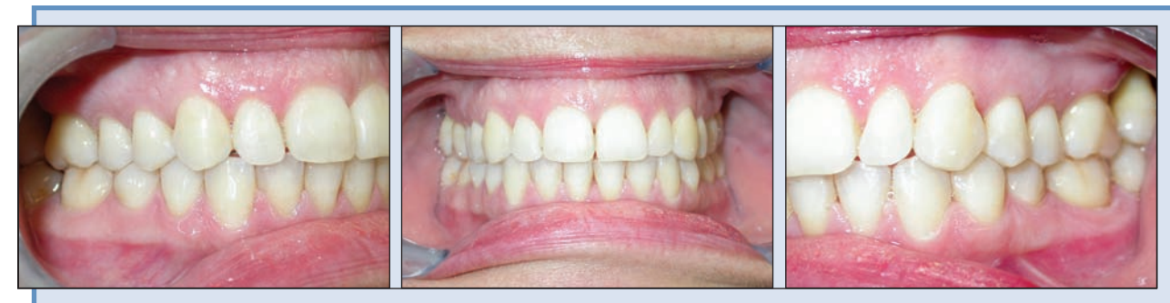
Figure 3: Post-treatment photographs showing proper proximal contacts and improved appearance of the papillae.