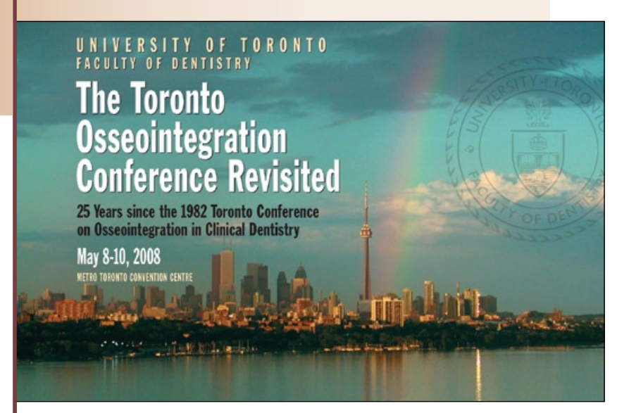
Figure 2: Flyer for the 25th anniversary conference

will it do more good than harm? (safety); will the patient accept the new intervention? (acceptability); is it worth paying for the intervention? (cost effectiveness); is this the right intervention for particular patients? (appropriateness) and are users, providers and other stakeholders satisfied with the intervention? These clinical questions of relevance have been pursued by the Zarb group. The other researchers selected different research avenues, assimilating knowledge from their past experiments, then charting new discoveries in hopes of refining or improving a technology even further. What can perhaps be said in this context is that there is no right or wrong approach, or appropriate or inappropriate avenue, as both databases have been important contributions to the field of osseointegration and dental implants. The ultimate result is that the research has benefited our patients.