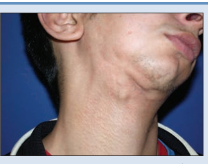
Figure 3: Extensive subcutaneous calcification in the right submandibular region and neck.