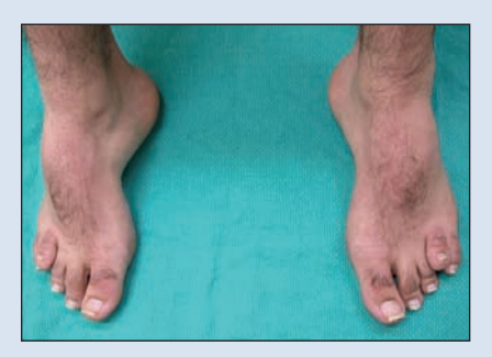
Figure 2c: Shortened fourth toes on both feet.