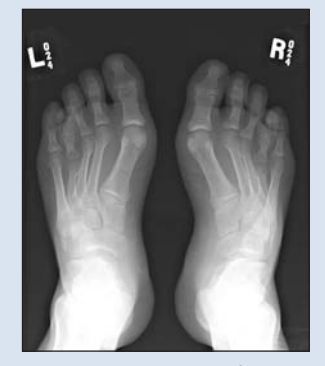
Figure 2d: Radiographs of both feet show bilateral shortening of the fourth metatarsals.

a forceps delivery and revealed below average growth and development. He had been admitted to hospital in Pakistan many times between 1989 and 1997, where he underwent surgical release of his mandible. The outcome was a short-lived improvement in opening.