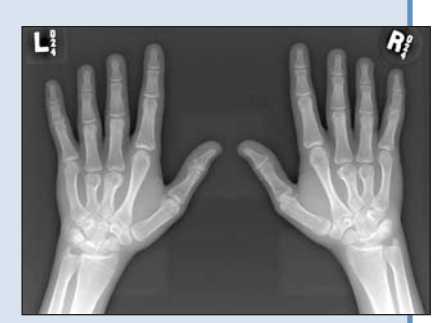
Figure 2b: Radiographs of both hands showing brachydactyly of the middle and ring fingers due to bilateral shortening of the third and fourth metacarpals.