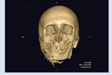
Figure 5b: Anterior 3-dimensional CT scan reconstruction of the skull showing fusion of the lattice-like calcification past the inferior border of the mandible.