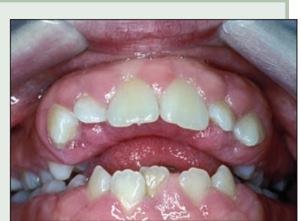
Figure 2: Gingival hyperplasia in a pediatric patient.

the immune system as well as important side effects that may affect dental treatment ( Table 1 ).<sup>4,6</sup>