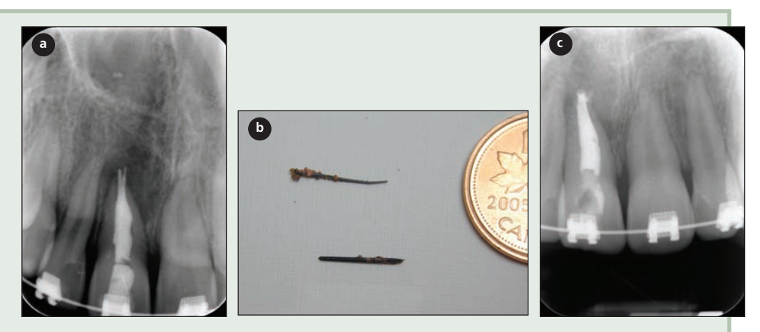
Figure 3: (a) Two small-diameter, carrier-based obturators were used in an attempt to seal this large canal. Insufficient fill resulted. (b) Retreatment involved removal of the carriers. (c) The canal was then cleaned, disinfected and obturated with mineral trioxide aggregate in the apical half followed by application of a core material to seal.

sufficiently to allow the heat source to penetrate (ideally, 5 mm from cone length).<sup>4</sup> The cone is compacted and excess material removed, leaving an apical plug. Backfilling with obturation material against this plug completes the procedure.