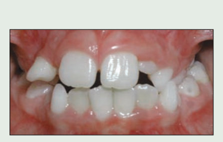
Figure 2: A 7-year-old girl presented with unilateral posterior crossbite on the left side, along with a 3-mm functional shift to the left and a midline discrepancy.