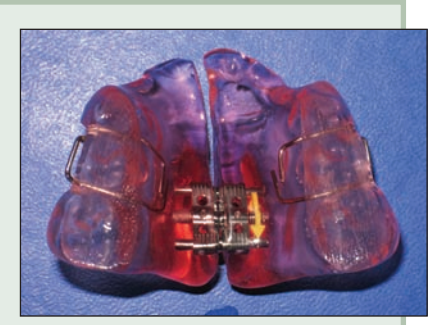
Figure 3: A removable maxillary expansion appliance was delivered, with instructions for full-time wear and turning 2 times per week.