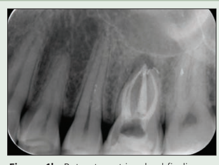
Figure 1b: Retreatment involved finding a fourth canal and cleaning and disinfecting to the canal terminus to set up the conditions for healing.