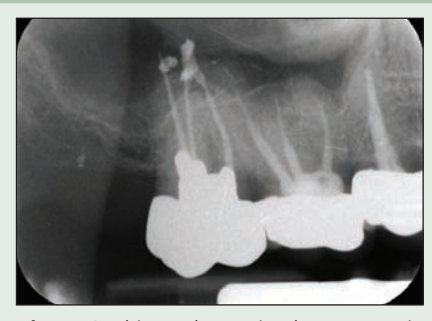
Figure 2: This tooth remained symptomatic following treatment. Poor apical control and the use of excess sealer with carrier-based obturators resulted in extrusion of excess material beyond the apex.