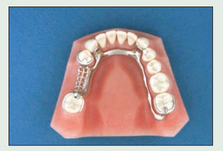
Figure 4: A prosthesis for replacement of only a few missing teeth may be unnecessary if the patient has no functional or esthetic complaints and there are no other reasons for replacement.