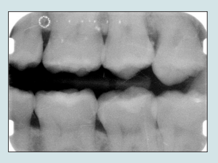
Figure 2: An image made on a photostimulatable phosphor (PSP) plate displaying widespread and severe damage to the PSP. This PSP should have been discarded long before it reached this state.

rupture the lingual artery, provoking a potentially lifethreatening event. Placement of implants in the anterior arch can cause a substantial hemorrhage in the highly vascularized floor of the mouth and result in life-threatening airway events.<sup>30</sup>