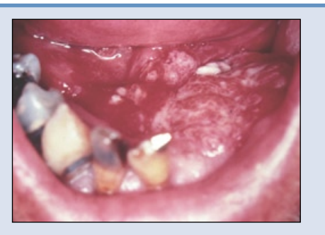
Figure 2: Conventional squamous cell carcinoma in the floor of the mouth.