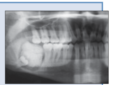
Figure 3: Panoramic radiograph showing the erupting odontoma and the impacted third molar, which was displaced to the disto-inferior region of the angle of the mandible.

the mandibular right third molar, which was displaced disto-inferiorly ( Fig. 3 ). A uniform, well-defined radiolucent halo surrounded the radiopacity except in the superior area where it erupted into the oral cavity. The right mandibular canal was displaced inferiorly. There was no evidence of any root resorption in the right mandibular second molar. Considering the clinical and radiologic presentations, a diagnosis of infected erupting complex odontoma was determined. Under general anesthesia, access to the mass was achieved via an intraoral approach and it was excised along with the impacted tooth, i.e., the mandibular right third molar ( Figs. 4a and 4b ). Histopathologic examination ( Fig. 5 ) of the excised mass confirmed the diagnosis of complex odontoma.