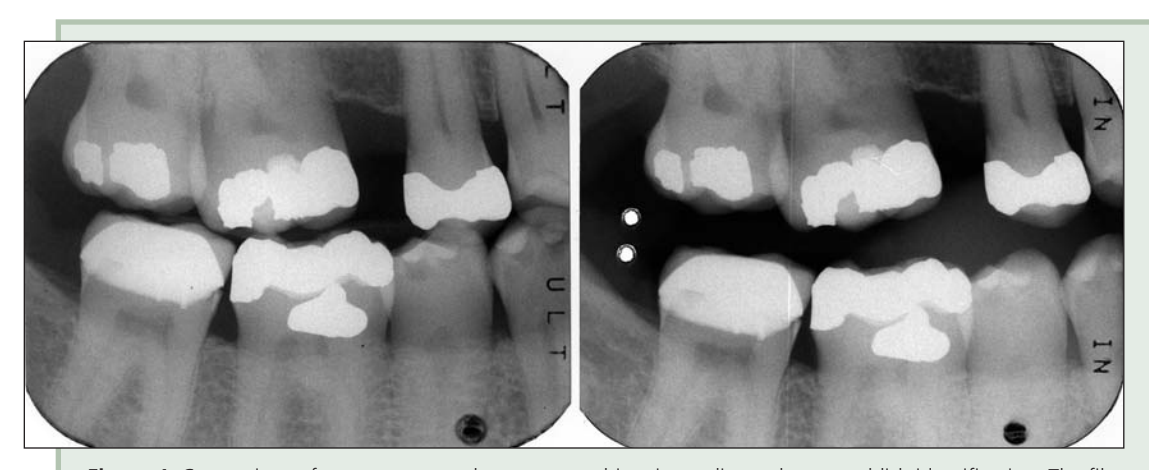
Figure 1: Comparison of antemortem and postmortem bitewing radiographs to establish identification. The film on the left was exposed during the patient's recall exam on January 16, 2007. The film on the right was exposed at autopsy on October 3, 2007, on a body found in a lake.

Normal variants in the shape and size of anatomic structures and various presentations of