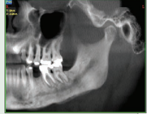
Figure 6: Pseudopanoramic image through the left hemimandible demonstrating sclerosis and periosteal new bone formation, an appearance consistent with osteomyelitis. The image was generated along an arc defined by the curvature of the mandibular body. This image is not, however, directly comparable with a traditionally acquired panoramic image.

maxillofacial or medical radiologist. Although the anatomic region depicted is limited with smallfield-of-view cone beam CT systems, systems with larger fields of view encompass radiographic anatomy that may be unfamiliar to many dentists, for example, the paranasal sinuses, the skull base, the tympanic cavity, the craniovertebral junction and the cervical spine.