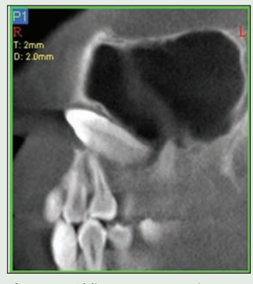
Figure 4: Oblique reconstruction along the axis of an impacted maxillary canine.