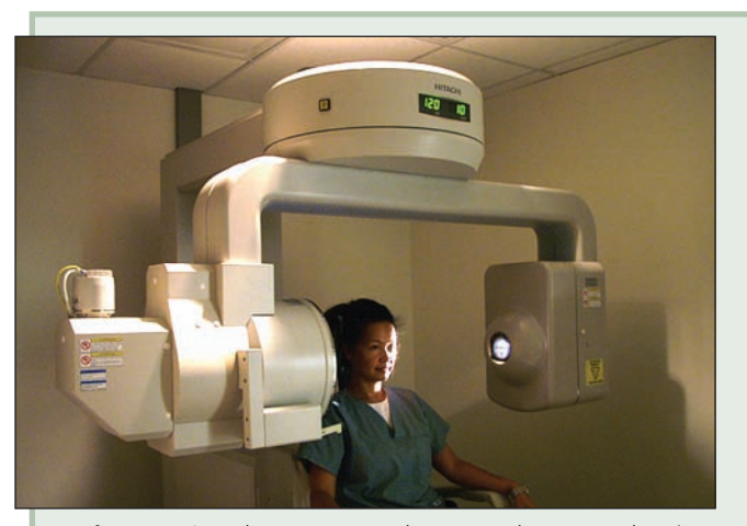
Figure 1: Cone beam computed tomography system showing the x-ray source (to the left of the model) and the receptor.

In addition to issues of image quality and radiation dose, a third major limitation of cone beam CT relates to management of the image data. In medicine, radiographic images are reported by radiologists, who accept liability for the findings. For the most part, however, dentists act as their own radiologists. As such, they are responsible for interpreting normal anatomy, anatomic variants and pathoses depicted on images of their own patients, unless the images are interpreted and reported by a second party, such as an oral and