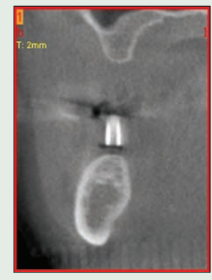
Figure 5: Buccolingual crosssectional image through an edentulous mandible. A radiopaque marker (overlying the mandible) shows the proposed site of implant placement.