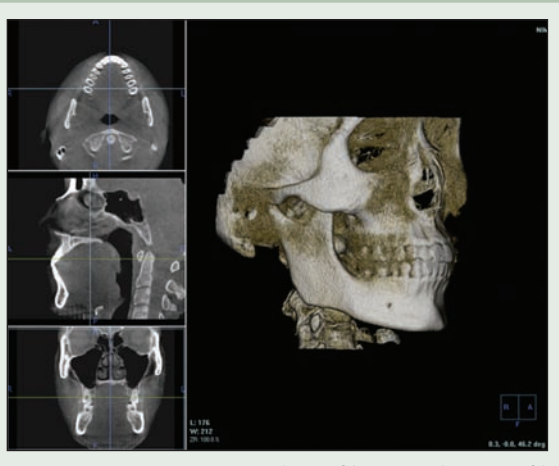
Figure 2: Axial or transverse (top left) sagittal (middle left) and coronal (bottom left) images, and a 3-dimensional rendering of a patient's image data (right).