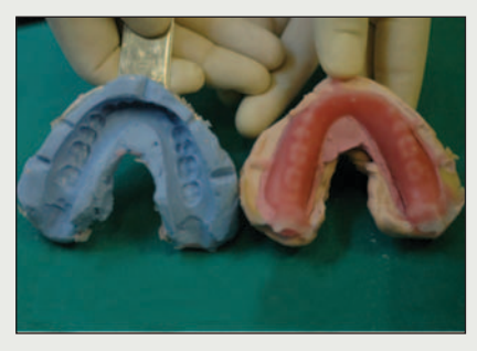
Figure 13: The halves of the mould are separated to reveal a wax replica of the denture.