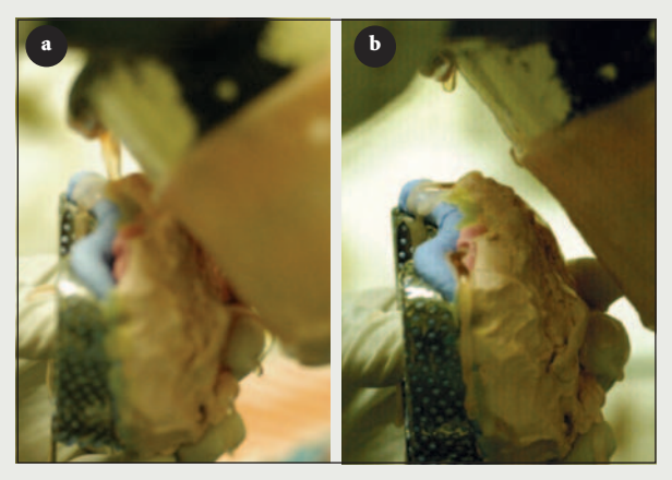
Figure 12: Pink modelling wax mixed with 10% sticky wax is poured into the mould (a) until it extrudes from the opposite sprue hole (b)