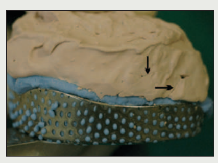
Figure 10: Any pieces of plaster that have fractured off (arrows) are fitted back together and sealed with sticky wax.