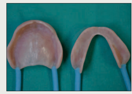
Figure 2: Periphery wax is used to attach a wax sprue to each side of the denture posteriorly.