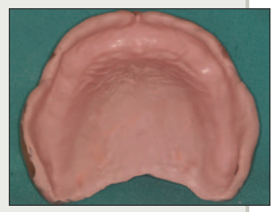
Figure 16: Final impressions for the new dentures are made using zinc oxide-eugenol paste or elastomeric impression materials inside the trial base.

shape and size. If a new jaw registration was made at an increased vertical dimension, set the occlusal plane at the previously determined position. Begin by replacing every other tooth, to help maintain arch form and tooth position (Fig. 14). After replacing the anterior teeth, and if an absolute likeness of the old dentures is desired, use the plaster cast of the denture to evaluate the arrangement. Wax up the completed trial dentures in preparation for the next clinical visit (Fig. 15).