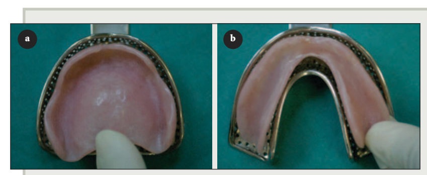
Figure 1: Impression material is placed into box tray for upper denture (a) and lower denture (b).

Choose box trays slightly larger than the patient's dentures, into which an impression material (normally irreversible hydrocolloid) will be placed to record the external surfaces of the denture (Fig. 1). If cost is of lesser consideration,