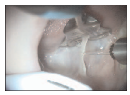
Figure 6: Lasing of frenum (DELight Er:YAG laser, Hoya ConBio Medical and Dental Lasers, Fremont, Calif.).