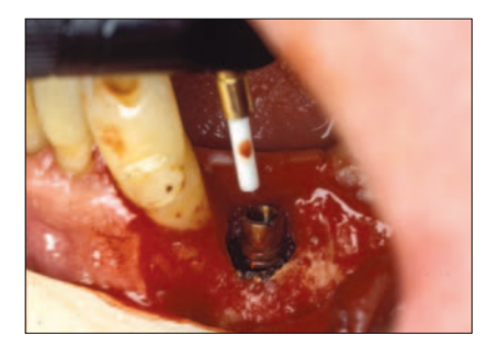
Figure 2: Decontamination of the implant surface using the defocused beam of the CO<sub>2</sub> laser.