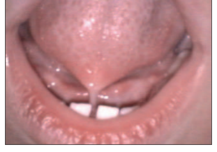
Figure 2: Untreated ankyloglossia in an infant.