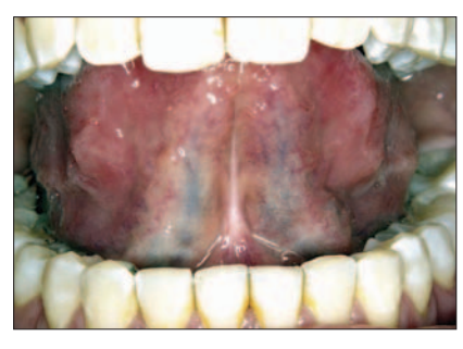
Figure 1c: Photo at one-year recall. Followup care was uneventful.