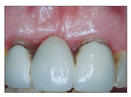
Figure 1: Preoperative photo of unesthetic bridge.