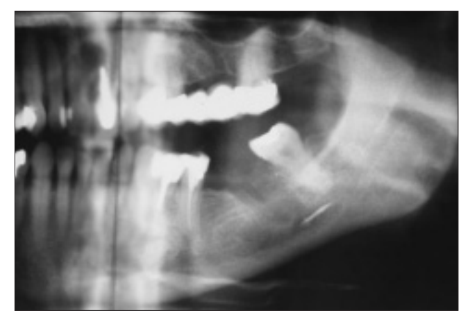
Figure 1: Panoramic radiograph showing radiopaque material in the inferior alveolar canal region.

Thermoplastic gutta-percha obturation techniques may be valuable for certain well-defined indications during endodontic therapy.<sup>2</sup> However, practitioners must take care to ensure proper technique during both instrumentation and obturation. There are numerous technical variations in the placement of warm gutta-percha,<sup>3</sup> which may involve