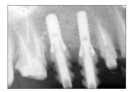
Figure 7c: Radiograph showing proper adaptation of the impression copings to the fixtures.