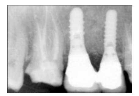
Figure 7e: Successful osseo-integration of the fixtures and intimacy of fit of the prosthetics.