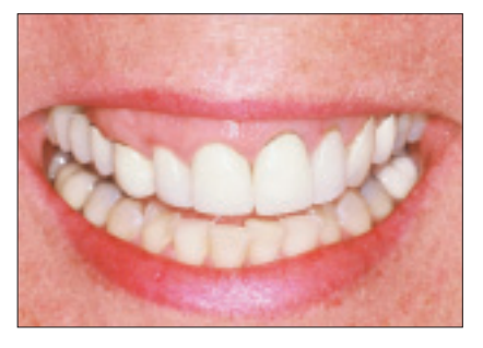
Figure 1b: The patient was aware of her deteriorating dental health, as evidenced by the exposure of crown margins and the associated tooth discoloration.