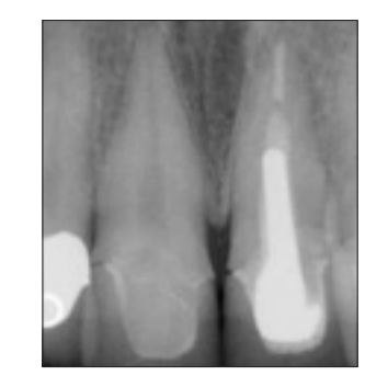
Figure 2b: Radiograph showing interproximal bone loss associated with embrasure space impingement.