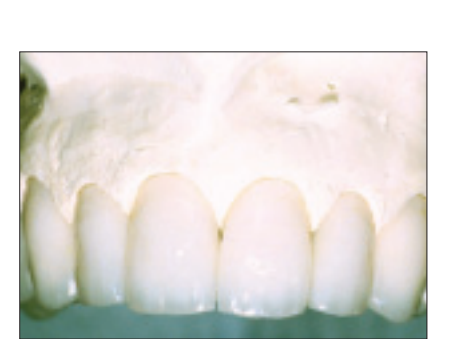
Figure 3: A heat- and pressure-treated acrylic transitional bridge was fabricated in the laboratory.