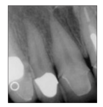
Figure 2a: Radiograph of the anterior teeth reveals ill-fitting margins.