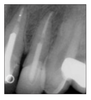
Figure 2c: Radiograph showing root canals with deficient apical seals and lack of intimacy of post and core fit.