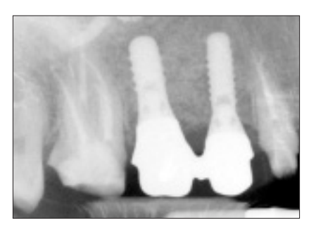
Figure 7d: The bridge framework is seated accurately on top of the abutments.