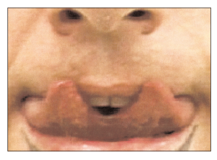
Figure 1: View of the tongue split during lingual elevation towards the prolabium.