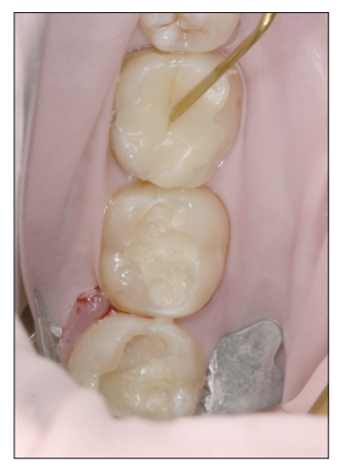
Figure 7: Grooves placed in uncured composite. Groove depth should be 1 mm.