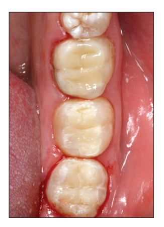
Figure 12: At this stage, only the surface of the first molar has been sealed with Biscover (Bisco Dental Products).