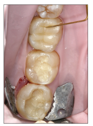
Figure 8: Groove placement completed in first molar.