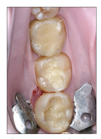
Figure 6: An enamel replacement (Micronew, Bisco Dental Products) is placed in the first molar, but not cured.