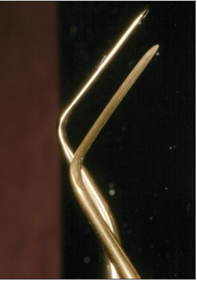
Figure 14: Very thin instrument (Interproximal Carver IPC, N-5110P, Bisco Dental Products) used for groove placement (top) compared with instrument of normal thickness.