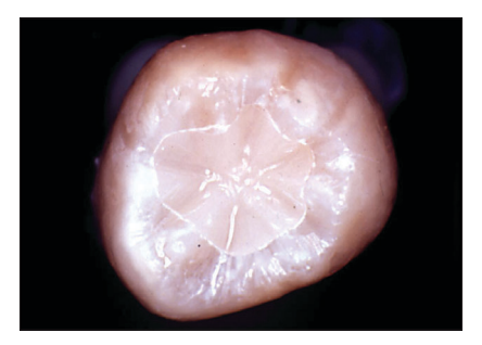
Figure 1: Visible white line around polymerized Class I restoration.

With minimal equipment and time, it is possible to significantly reduce this risk and create a more beautiful restoration. The procedure involves simply placing a series of narrow grooves, approximating the developmental grooves, down the middle of the restoration before polymerization. This will provide additional unbonded surfaces that can distort during polymerization, thus reducing the stress on the cavosurface margin. A sealer should be applied after polymerization and occlusal adjustment.