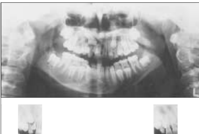
Figure 3: The degree of asymmetry of the eruption of the 13 and 23 and the overlap of the 13 with the 12 were signs of impaction. Panoramic and periapical radiographs were used to locate the 13 on the palate.

the potential for mechanical disturbances resulting in displacement and, thus, impaction.