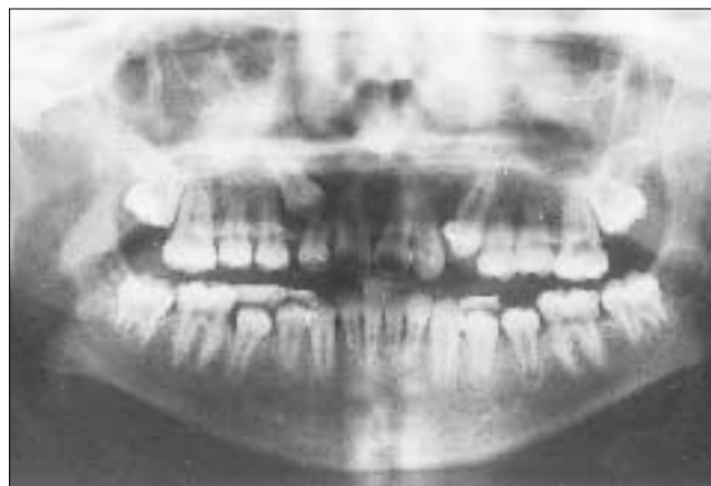
Figure 2: Significant asymmetry of the eruptive stages of maxillary permanent cuspids may be a sign of potential impaction. The 13 was palatally impacted and required surgical exposure and orthodontic alignment.