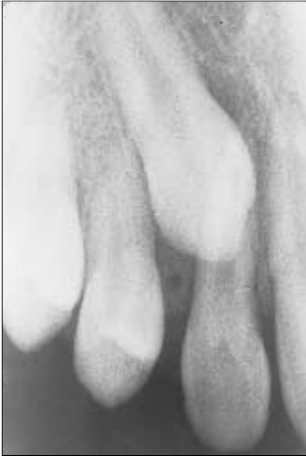
Figure 4: Significant overlap of the maxillary cuspid and the lateral incisor makes recovery of the impacted canine following extraction of the primary cuspid less likely.

impactions can cause the lateral incisor to rotate as well. 9 Retroclined lateral incisors can also occur when buccally directed forces cause the root to tip labially and the crown to tip palatally. 16 In severe cases, the central incisor may also be affected, and its crown may become malpositioned. 16