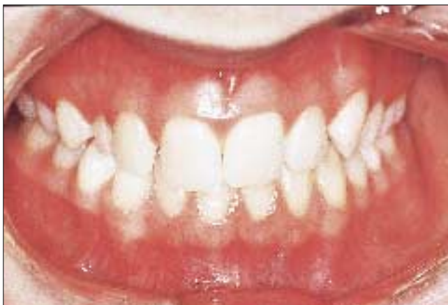
Figure 1: Clinical examination revealed asymmetry between right and left cuspids; the 53 was overretained and not mobile whereas the 63 had exfoliated naturally allowing the 23 to erupt into the arch. The 13 was palatally impacted and required surgical exposure and orthodontic alignment.