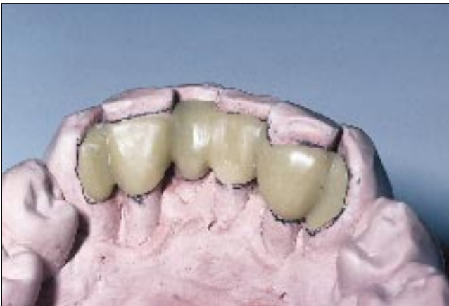
Figure 3: A composite-resin-based splint has been fabricated from DiamondCrown material. Once polished, it will be ready for cementation.