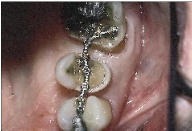
Figure 5: Metal-based wire splint (Splint-Lock System, Whaledent Inc., New York, NY) is secured to mobile teeth with individual metal-based pins. The metal splint is then covered and bonded to the mobile teeth with composite resin.

most of the remaining teeth, as well as increasing support in the anterior region of the mouth with osseointegrated implants. Approximately one year after conclusion of the implant treatment, the contact region between the upper left