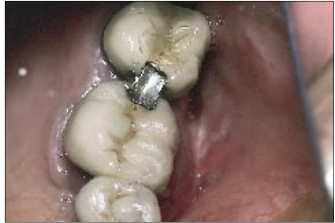
Figure 7: The inlay has been cemented with Metabond C&B. The inlay remained secure after 4 years of service.