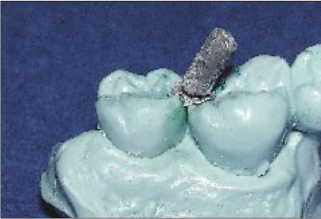
Figure 6: Inlay made from non-noble metal has a handle and has been cast, fit to the master cast and etched; once the inlay is cemented in place, the handle is sectioned and removed.