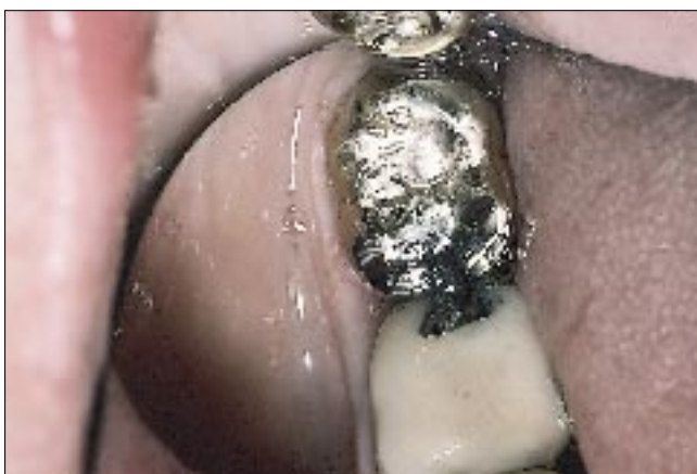
Figure 11: The metal splint has been bonded in position. The splint has been functioning without complications for 3 years.

bonding cements and surface treatments, intraoral bonding is possible. Intraoral air abrasion (microetching) allows a metal surface to be roughened and cleaned. Etching porcelain with hydrofluoric acid roughens and cleans the surface. Applying a silane coupler and then a bonding agent to the porcelain and then using a bonding resin cement allows the complete restoration to be sealed and secured in place.