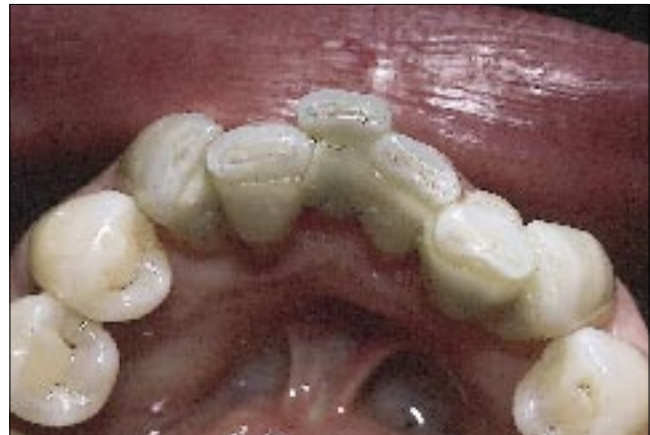
Figure 4: DiamondCrown splint has been cemented (bonded) under rubber dam isolation. This material exhibits superior flexural strength and may be useful in extracoronal splints.