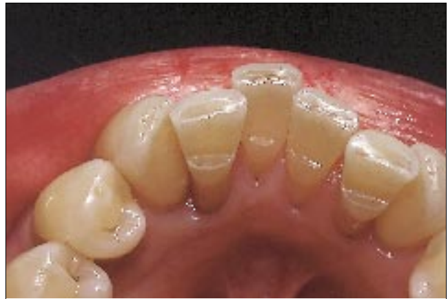
Figure 2: Mobile teeth have been prepared with cingulum rests to help support an extracoronal composite-resin-based splint.