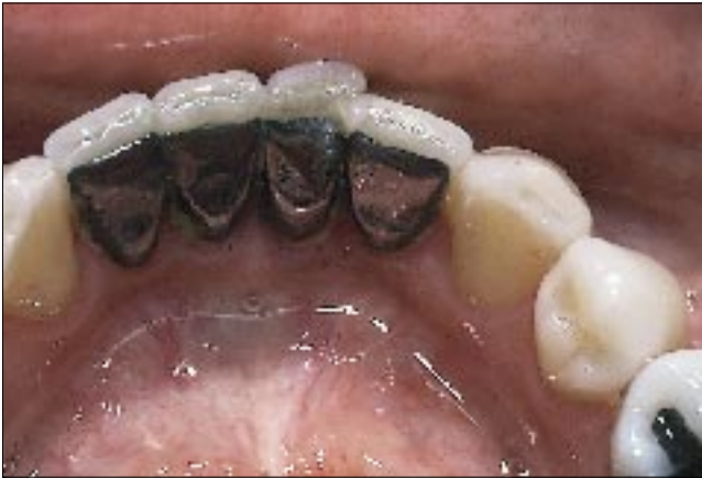
Figure 1: Metal splint created from non-noble metal has been bonded with Metabond C&B cement and is being used to secure mobile teeth.