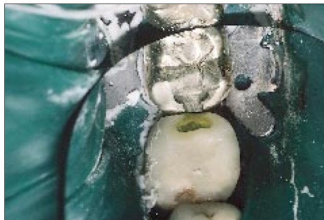
Figure 10: Teeth 36 and 37 have been isolated and treated on the basis of their respective materials. The metal surface (tooth 37) has been air abraded (microetching), and the porcelain surface (tooth 36) has been etched with hydrofluoric acid. The crowns are now ready for bonding.