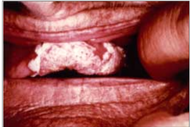
Figure 2: Verrucous carcinoma