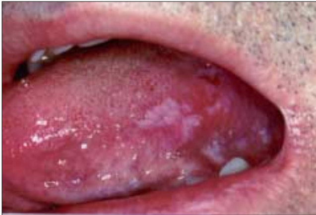
Figure 1: Squamous-cell carcinoma