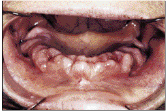
Figure 2: Pre-chemotherapy gingival hyperplasia following dental extraction.

leukemia. 4 Histologic characteristics are similar for each subtype of leukemia aside from the morphologic form of the invading cells. These cells are characterized by abundant mitotic figures. Typically, the lamina propria is densely packed with leukemia cells extending from the basal cell layer of the epithelium into the gingiva, thereby altering the normal anatomy. Regional blood vessels are compressed by the infiltrate.