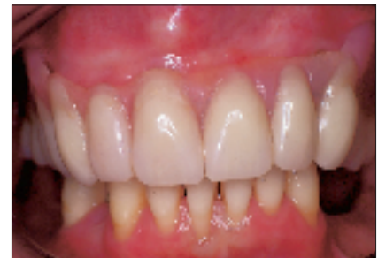
Figure 8: Frontal view of patient with complete maxillary denture.

It was clear that oral hygiene compliance needed reinforcement. This reinforcement included reminders of basic home care procedures as well as the provision of a thermoplastic template to assist stannous fluoride home application. Diet modification was suggested.