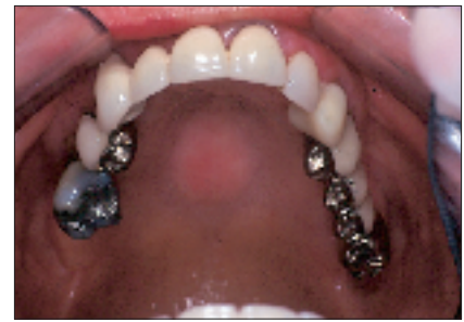
Figure 2: Palatal view of patient's dentition upon presentation.