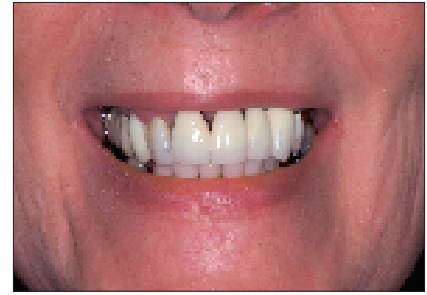
Figure 4: Frontal view showing patient's high smile line.