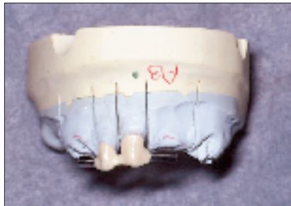
Figure 5: Frontal view of overdenture abutment for 11 and 12 on master model.