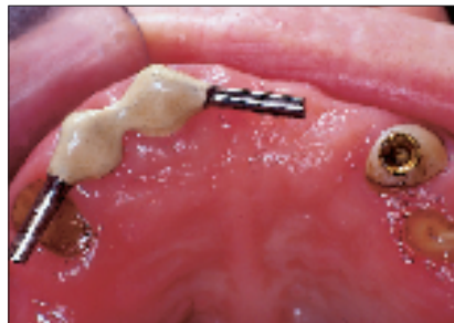
Figure 7: Palatal view showing stud attachment in 23 and abutment in 11 and 12.