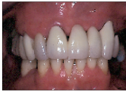
Figure 1: Frontal view of patient's dentition upon presentation.

Using a 2-mm-wide reinforcement ribbon (Connect, Kerr Manufacturing Co., Orange, CA), a provisional fixed partial denture was fabricated (Integrity, Dentsply/Caulk, Milford, DE) and placed using a provisional luting cement (Temp-Bond, Kerr Manufacturing Co., Orange, CA).