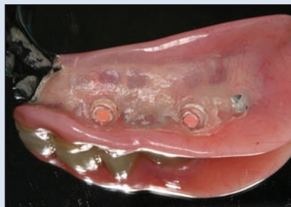
Figure 5b: Intaglio surface of the implant-supported RPD.