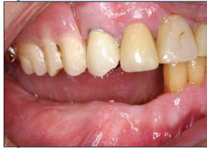
Figure 1: Intraoral view of the right mandible. The right lateral incisor, canine, premolars and molars are missing.

The initial treatment consisted of scaling, root planing and oral hygiene instruction. The patient's existing conventional RPD was duplicated with self-curing acrylic resin (Ortho-jet, Lang Dental, Wheeling, IL) to fabricate a surgical stent. The surgical procedure consisted of local anesthesia and crestal incision, followed by elevation of