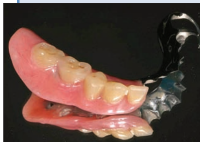
Figure 5a: Occlusal surface of the implant-supported removable partial denture (RPD).