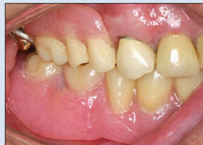
Figure 6: Intraoral view of the implant-supported RPD.

both maxilla and mandible were fabricated. The final impressions were made with silicone impression material, and then the definitive maxillary and mandibular casts with 2 locator analogues were poured and mounted on a semiadjustable articulator (Whip Mix Co., Louisville, KY), using a facebow and a centric relation record. After the occlusal wax rims had been tried in on the record bases, the tooth arrangement was completed and heat-curing acrylic resin was processed in the laboratory (Fig. 5). The maxillary conventional RPD and the mandibular implant-supported RPD, with 2 plastic retentive parts seated on the locator abutments, were delivered the same day (Fig. 6).