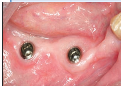
Figure 3: Three months after placement of the implants, the healing abutments were removed.