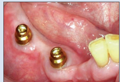
Figure 4: The locator abutments were tightened on the implants.

a full-thickness mucoperiosteal flap. After the implant sockets had been prepared ( Fig. 2 ), 2 implants (4.1 mm in diameter, 12 mm in length; Straumann AG, Waldenburg, Switzerland) were placed without complication in the areas of the mandibular right second premolar and the right second molar using a one-stage surgical approach and a torque controller. The final insertion torque values recorded during placement of the implants were 35 and 40 Ncm, respectively. The mucosa was sutured after placement of the implants, with the healing abutments exposed. The placement of these 2 distal implants effectively changed the Kennedy classification of the partially edentulous arch from Class I (supported by tooth and tissue) to Class III (supported by tooth and implant). The patient's existing mandibular RPD was lined with soft-reline material after sufficient room had been established between the healing abutments and the interior acrylic surface of the denture, and the patient used the modified RPD during the osseointegration period.