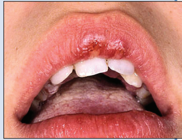
Figure 2: Lip lesions in primary herpetic gingivostomatitis in a woman in the 13th week of pregnancy.

In spite of the knowledge that herpes virus infections are extremely contagious, among all the files of this busy urban reference centre for oral diseases within this time span, we were able to find only 2 cases of acute herpetic gingivostomatitis during pregnancy. This would be consistent with an assumed low incidence of HSV-1 infection in pregnancy.