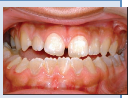
Figure 2: Intraoral photograph for patient no. 3 at age 16 years, 4 months. Class III malocclusion and posterior open bites are frequent findings in patients with osteogenesis imperfecta. Dental discoloration is an additional feature with concurrent dentinogenesis imperfecta.

whom were reviewed correspond to a population of 300,000 people, probably more, since our group comprised children and adolescents exclusively.<sup>12</sup>