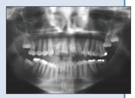
Figure 5: Panoramic view at age 18 years 6 months (patient no. 3). Teeth 18, 48, 27 and 28 are impacted.