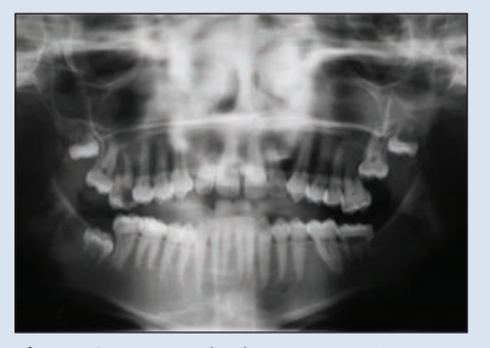
Figure 3: Panoramic view at age 16 years 4 months (patient no. 3). Tooth 16 is abscessed. Tooth 27 has not yet erupted. The maxillary incisors and the bicuspids show progressive pulpal calcification.