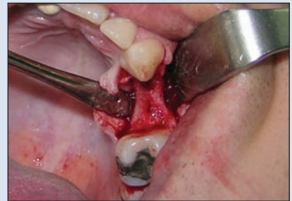
Figure 2f: Exposure of the alveolar bone for dental implant placement 9 months after alveolar socket preservation. Newly formed bone is solid and there are no visible signs of particles.