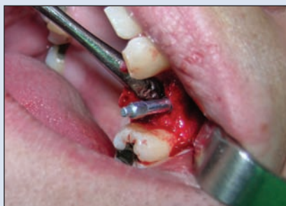
Figure 2g: Test of implant position in the preservation area. No reduction in vertical bone height was recorded when the 9-month measurements were made and subsequently compared with baseline measurements at tooth extraction.