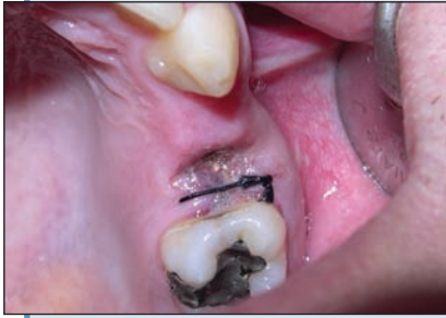
Figure 2a: At 5 days following placement of \beta -TCP combined with type I collagen in the alveolar socket, the socket opening is covered with fibrin.