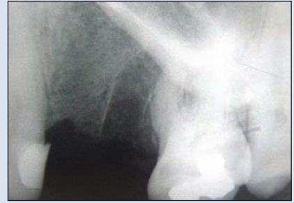
Figure 2c: Periapical radiograph taken 7 days after insertion of \beta -TCP combined with type I collagen.