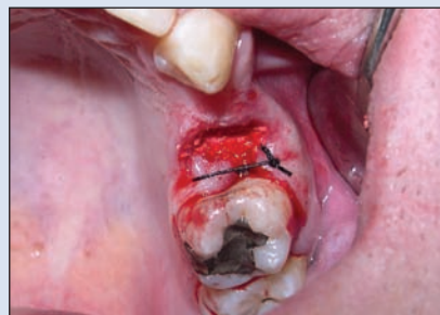
Figure 1e: \beta -TCP combined with type I collagen implant secured with a single suture without a barrier membrane or mucoperiosteal flap.

materials is warranted. 4-6 Although autogenous bone is still considered the gold standard for grafting procedures, limitations, such as donor site morbidity from bone graft harvesting techniques, 7 have stimulated the search for suitable synthetic grafting materials. Although barrier membranes may be used to guide bone regeneration, wound dehiscence may lead to early exposure and infection of the membrane followed by reduction in the volume and quality of bone. 8,9