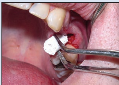
Figure 1d: Placement of \beta -TCP combined with type I collagen (RTR Cone) at the extraction site.