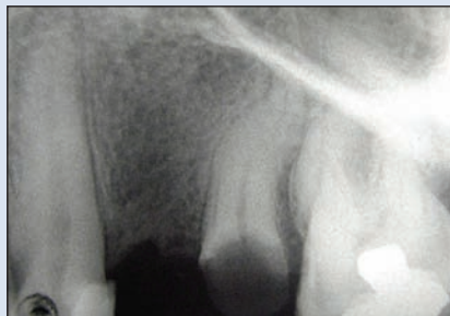
Figure 1a: Periapical radiograph of deteriorated left maxillary second premolar before extraction.