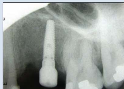
Figure 2h: Titanium implant immediately after placement, positioned within the bone of the healed socket 9 months postextraction.

barrier membrane or mucoperiosteal flap. The distobuccal and palatal papillae and attached gingiva at the extraction site were stabilized with a single interrupted suture to reduce the opening of the socket and the amount of exposed material (Fig. 1e). The patient was prescribed a course of antibiotic and pain medications with postoperative instructions for 7 days, at which point the suture was removed.