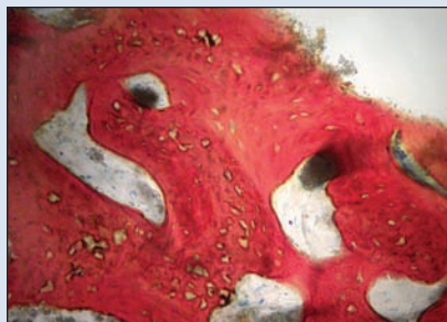
Figure 3b: High-power image of a biopsy core taken 9 months after socket preservation. Residual \beta -TCP and various sizes of dispersed particles are being incorporated into new bone. Large irregular lacunae appear to include \beta -TCP. \times 200 magnification. Stevenel's blue and Van Gieson's picro fuchsin stain.

Okla.) and stained with Stevenel's blue and Van Gieson's picro fuchsin. The parameters evaluated included the total area of the core, the percentage of new bone formation, the percentage of residual graft and the percentage of fibrous tissue. All parameters were evaluated by analyzing digital images in the NIH Image Program (National Institutes of Health, Bethesda, Md).