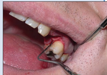
Figure 1c: Determination of the crestal alveolar bone level before socket preservation.