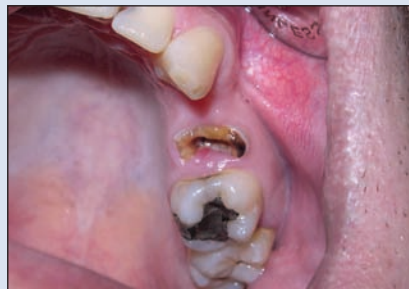
Figure 1b: Remnant of the maxillary second premolar structure with extensive coronal destruction.