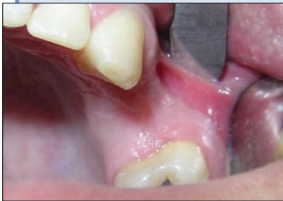
Figure 2d: The postextraction healed gingival wound 4 months after alveolar socket preservation.