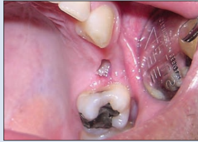
Figure 2b: At 7 days, the extraction socket is covered with healing gingival tissue.