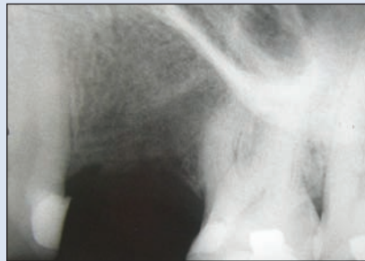
Figure 2e: Periapical radiograph taken 9 months following socket preservation showing complete bone fill of the socket.