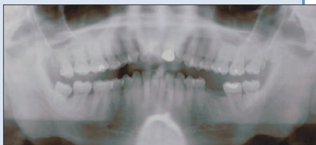
Figure 1: Preoperative panoramic radiograph showing advanced periodontal bone loss.

The procedure had been recommended by his periodontist due to advanced periodontal bone loss and associated tooth mobility ( Fig. 1 ). Performed by an oral surgeon in July 2005 under intravenous sedation, the procedure involved the extraction of his maxillary and mandibular third molars. Surgical incisions involving the sulcular, buccal, lingual and palatal tissues in both the maxillary and mandibular posterior regions were carried out to allow access for thorough debridement and recontouring of the residual osseous defects in these areas. The patient was prescribed analgesics that are used routinely during postsurgical recovery.