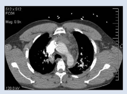
Figure 2: Computed tomography scan of lungs consistent with bilateral fat emboli.

integrity of marrow vessels, the availability of particulate fat and marrow and the pressurization of the medullary space.<sup>14</sup> The presence of marrow fat has been demonstrated in the femoral vein within seconds of intramedullary manipulation, as has the presence of echogenic material passing through the right ventricle during instrumentation of the medullary cavity of the femur.<sup>15</sup> These emboli can travel and lodge in vessel-rich areas, producing local ischemia, inflammation and platelet aggregation. The biochemical theory is based on the premise that hormonal changes due to trauma or sepsis induce the release of free fatty acids from plasma as chylomicrons, which are stimulated to coalesce.<sup>16,17</sup> FES is believed to be caused by the toxic effects of free fatty acids liberated at the endothelial layer which cause capillary disruption, perivascular hemorrhage and edema.<sup>18,19</sup>