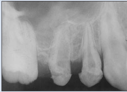
Figure 6: Periapical radiograph taken at age 14.5 years, showing continued root development in tooth 14.