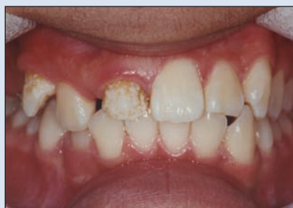
Figure 3: Frontal view of the patient at age 12.5 years, showing tooth 11 with hypoplastic, short crown. Mild hypoplasia is also seen on tooth 13.