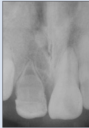
Figure 7: Periapical radiograph of tooth 11 showing amorphous calcification in the coronal half of the pulp chamber.

but its pulp chamber remained enlarged and radicular dentin was very thin on the mesial side. Some amorphous calcification was also seen in the pulp chamber of the maxillary right central incisor (Fig. 7).