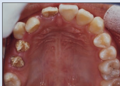
Figure 4: Occlusal view of the patient's maxillary arch, showing hypoplastic, discoloured right premolars.