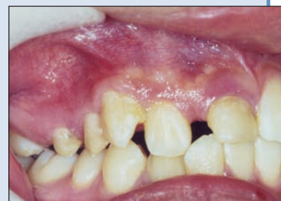
Figure 5: Buccal view of the patient taken 6 months after placement of the composite restorations on teeth 11, 13, 14 and 15.

Although many clinicians prefer to extract the anomalous teeth as soon a diagnosis of RO is made, 6,7,10 some prefer to retain them until skeletal growth is complete as long as they are free of infection. 4,13 In this article, a case of RO managed by a conservative approach is described.