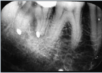
Figure 1: Intraoral periapical (IOPA) radiograph taken at the patient's first visit in 2004. Root resorption is distinct but the periodontal ligament space seems to be intact, with slight radiolucency around the mesial root. There is no evidence of ankylosis.