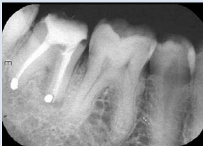
Figure 5: Postobturation IOPA view showing a healthy periapical area.