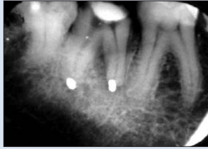
Figure 2: IOPA radiograph taken in 1984, 6 months after the intentional replantation, shows slight resorption of the mesial root. Retrograde amalgam fillings were placed and the coronal pulp chamber was sealed with amalgam. No biomechanical preparation was done.