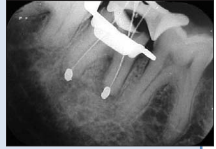
Figure 3: IOPA radiograph taken during endodontic treatment. A reduction in the radiolucency and the uniform periodontal ligament space can be observed. The lamina dura is distinct around the distal root and on the mesial aspect of the mesial root.